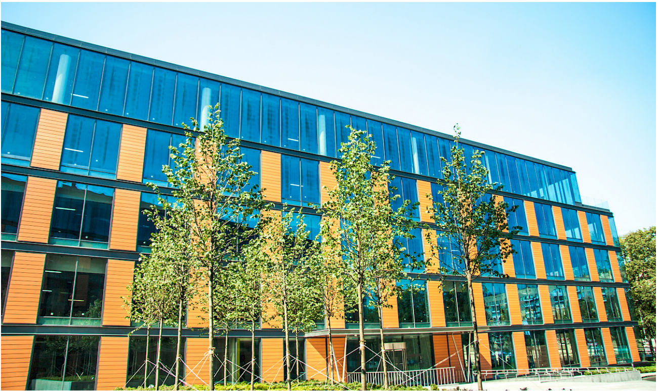
Characteristics of a building in the harmonious-modern category: functional with an understated design