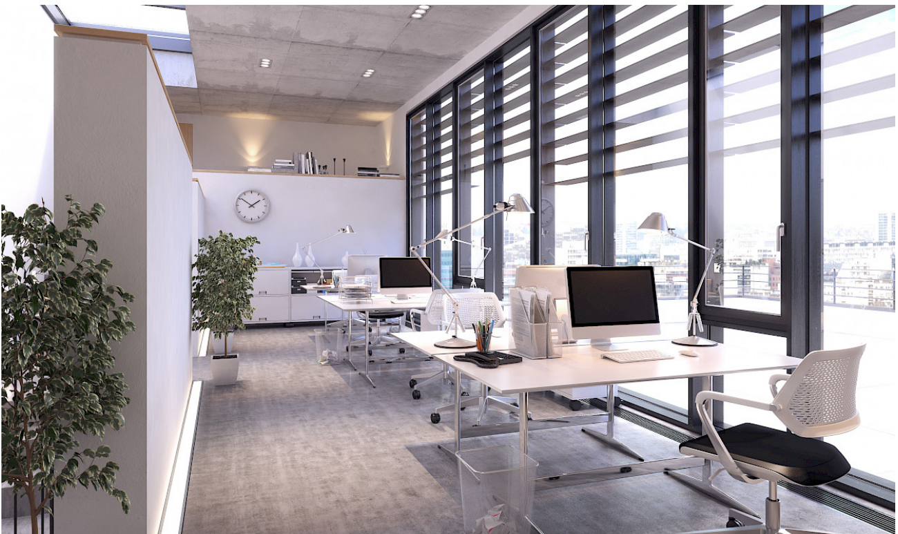
Characteristics of the furnishings in the harmonious-modern category: an oasis of well-being